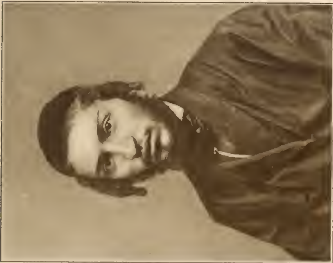
A JEW OF THE POORER TYPE